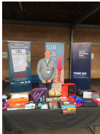
Awareness raising at Kirkintilloch Canal Festival

By educating our communities in the dangers of illicit or counterfeit goods we can protect ourselves from potential harm, reduce the demand for these products and help in the fight against Organised Criminal Groups.