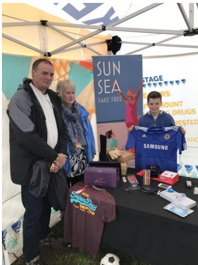
Fake goods on display at Inverness Belladrum Festival

Officers from Police Scotland have been raising awareness of illicit and counterfeit goods throughout Scotland with the emphasis on educating our communities on the dangers of fake products and the links to organised crime. The roadshows have taken in music festivals, local gala days and other events in the annual calendar.