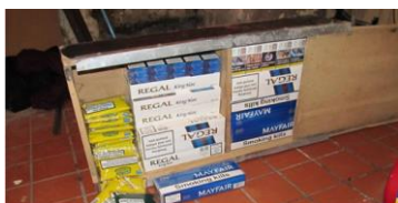
Cavity behind step